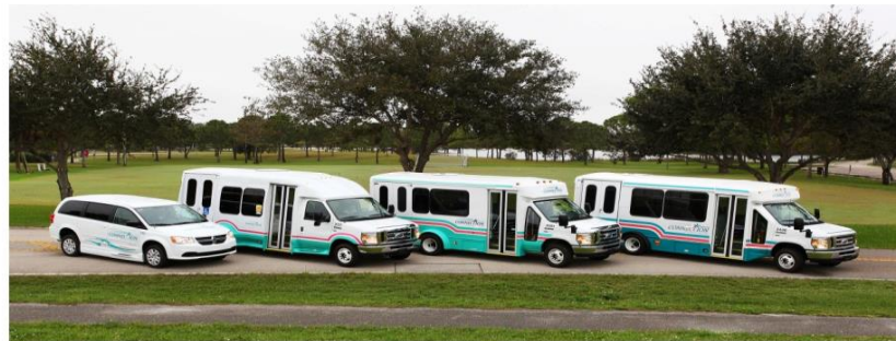
PALM TRAN CONNECTION NEW PARATRANSIT FLEET MODELS BRAUN MINI-VAN, TURTLETOP, GLAVAL 6/2, CHAMPION 6/2